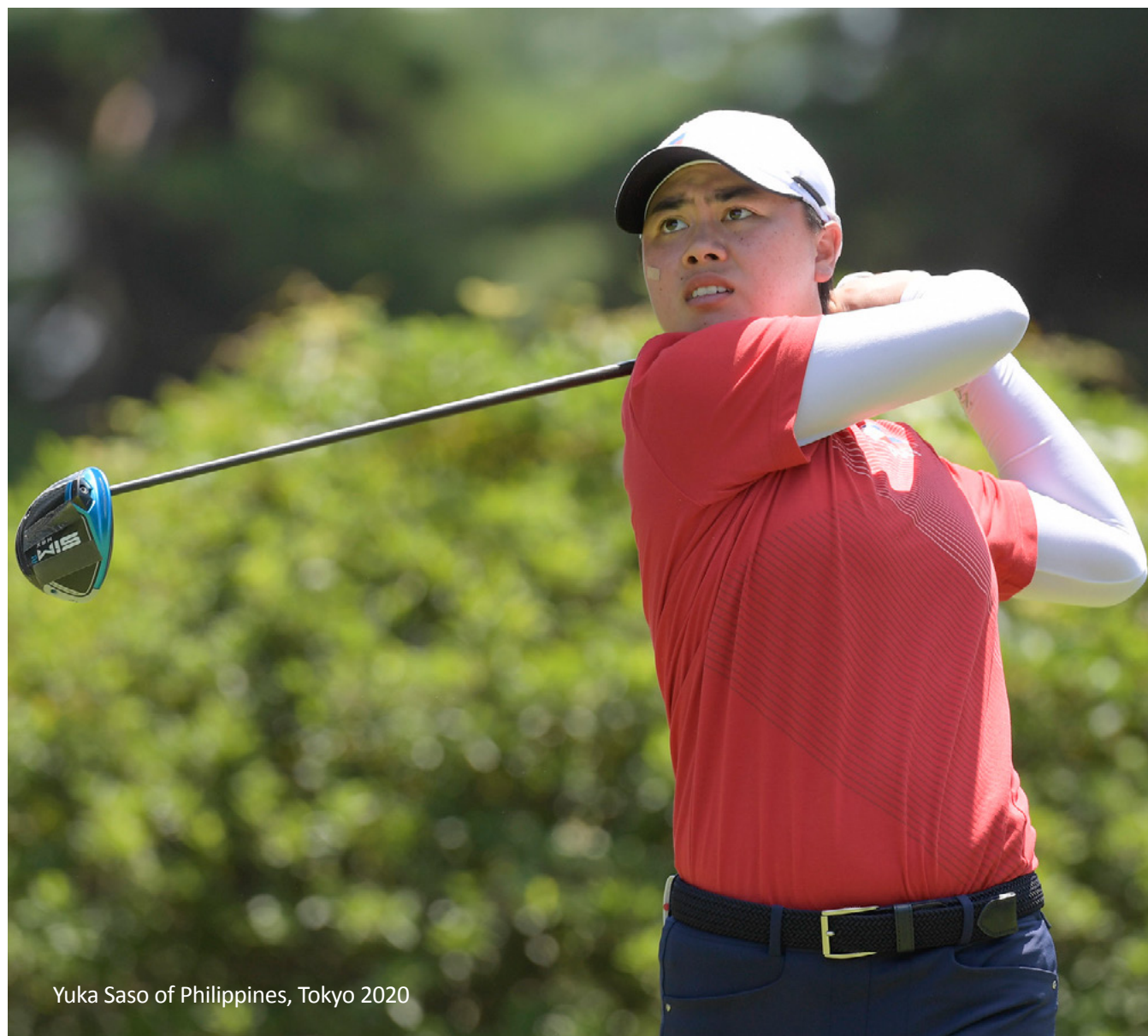
Yuka Saso of Philippines, Tokyo 2020

On 7 March 2022, the Committee met again to focus on planning for Paris 2024, in particular the agronomy and homologation plans for Le Golf National course, which will host the Olympic golf competition. ●