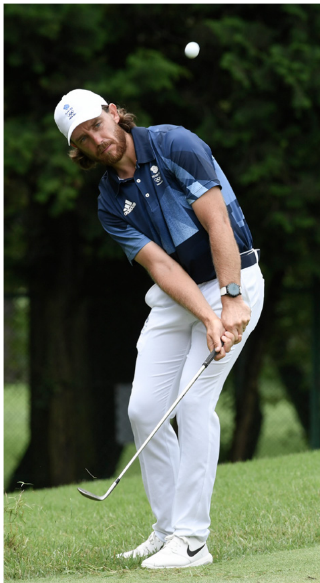
Tommy Fleetwood of Great Britain, Tokyo 2020

The IGF would like to sincerely thank Thongchai Jaidee, Suzann Pettersen, So Yeon Ryu, Alena Sharp and Henrik Stenson for their invaluable contributions to the IGF Athletes' Committee's activities for the Olympic Games Tokyo 2020. ●