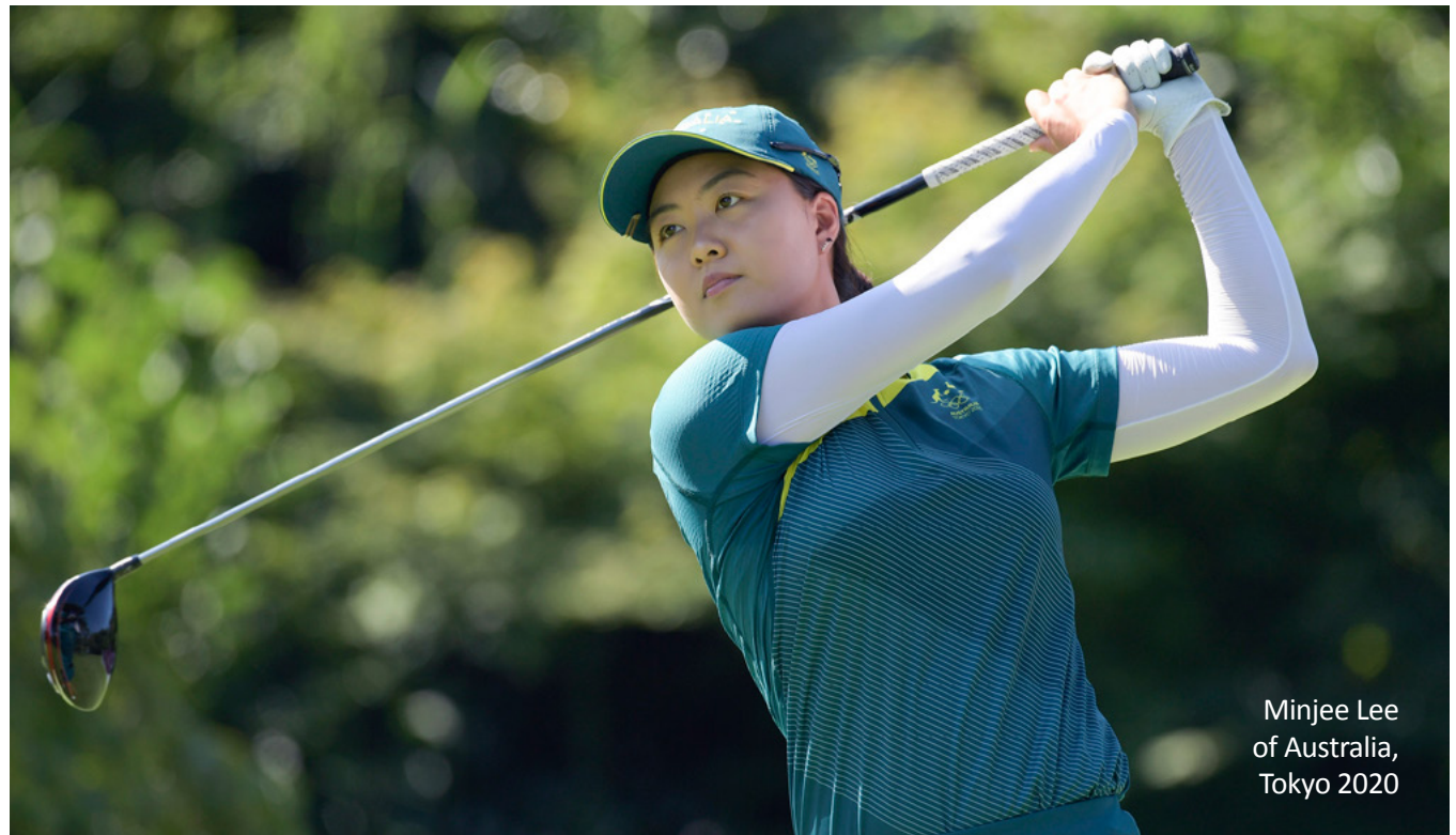
Minjee Lee of Australia, Tokyo 2020

Australia, PGA of Australia and the WPGA Tour of Australia in the determination of the venue. ●