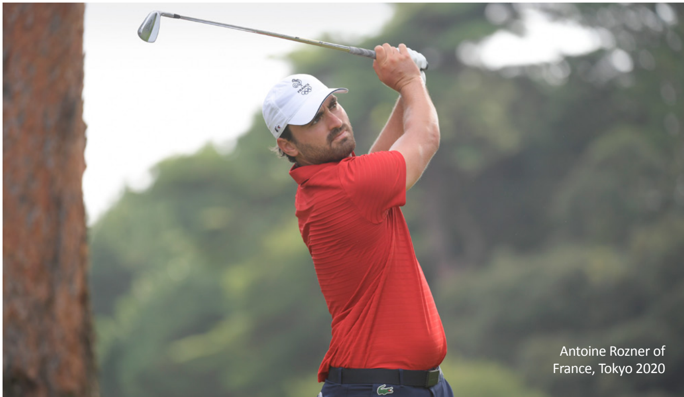
Antoine Rozner of France, Tokyo 2020

The International Olympic Committee (IOC) Executive Board approved the qualification system for Paris 2024 on 1 April 2022. Qualification for the events commenced on 17 June 2022 for the men and on 24 June 2022 for the women and will run over a two-year period until the 17 June 2024 ►