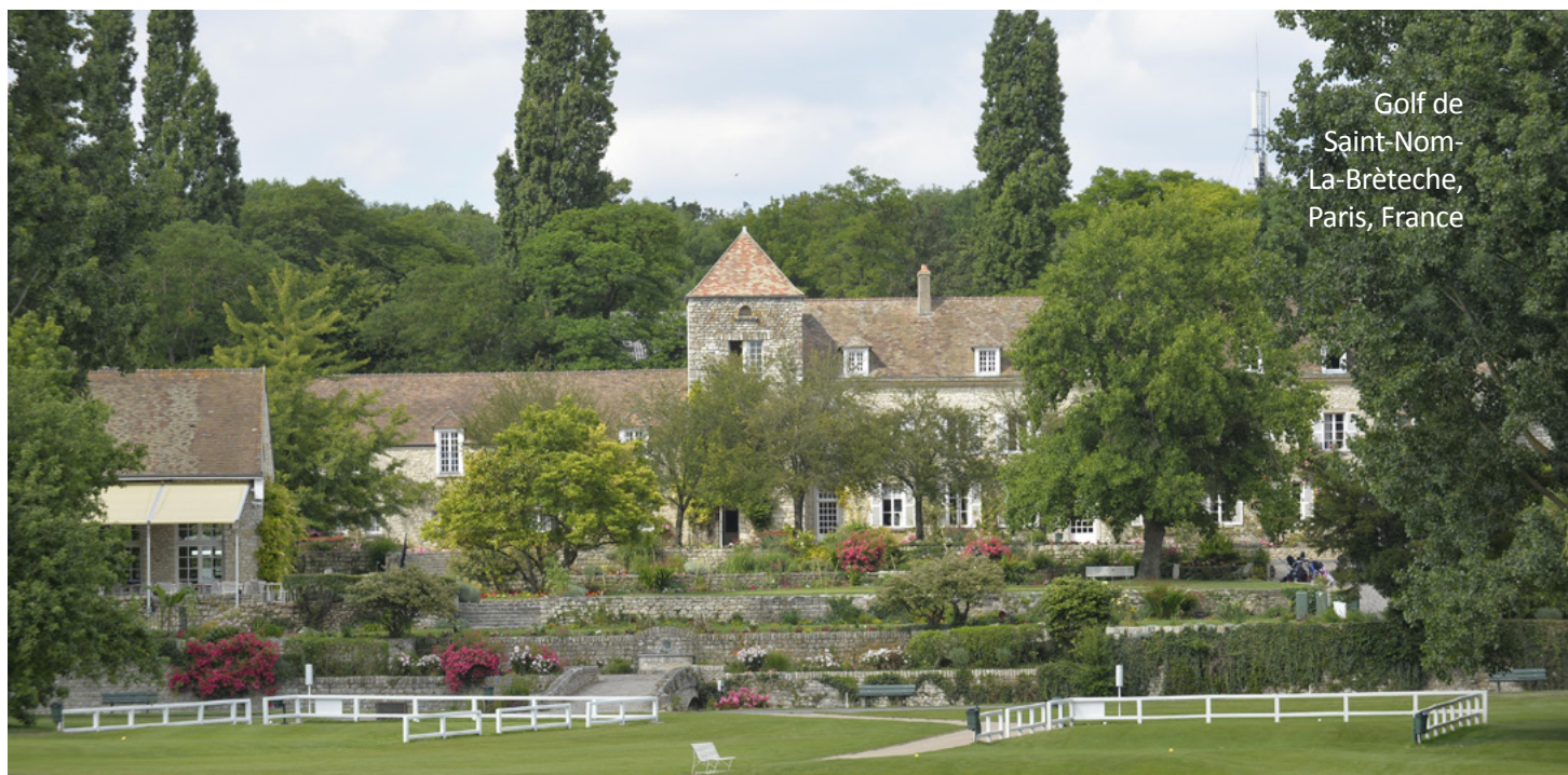
Golf de Saint-Nom- La-Brèteche, Paris, France

The IGF is extremely appreciative of the partnership and cooperation it has enjoyed with the French Golf Federation (ffgolf) throughout the planning and preparation of the 2022 World Amateur Team Championships (WATC), and we are confident this will be reflected in the experiences of all those who participate in the Championships.