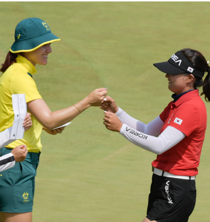
Hannah Green of Australia and Jin Young Ko of Republic of Korea

The IGF recognises the importance of the rights and obligations of our athletes. The Athletes' Committee acts as a consultative body and link between active athletes and ensures their interests are protected.