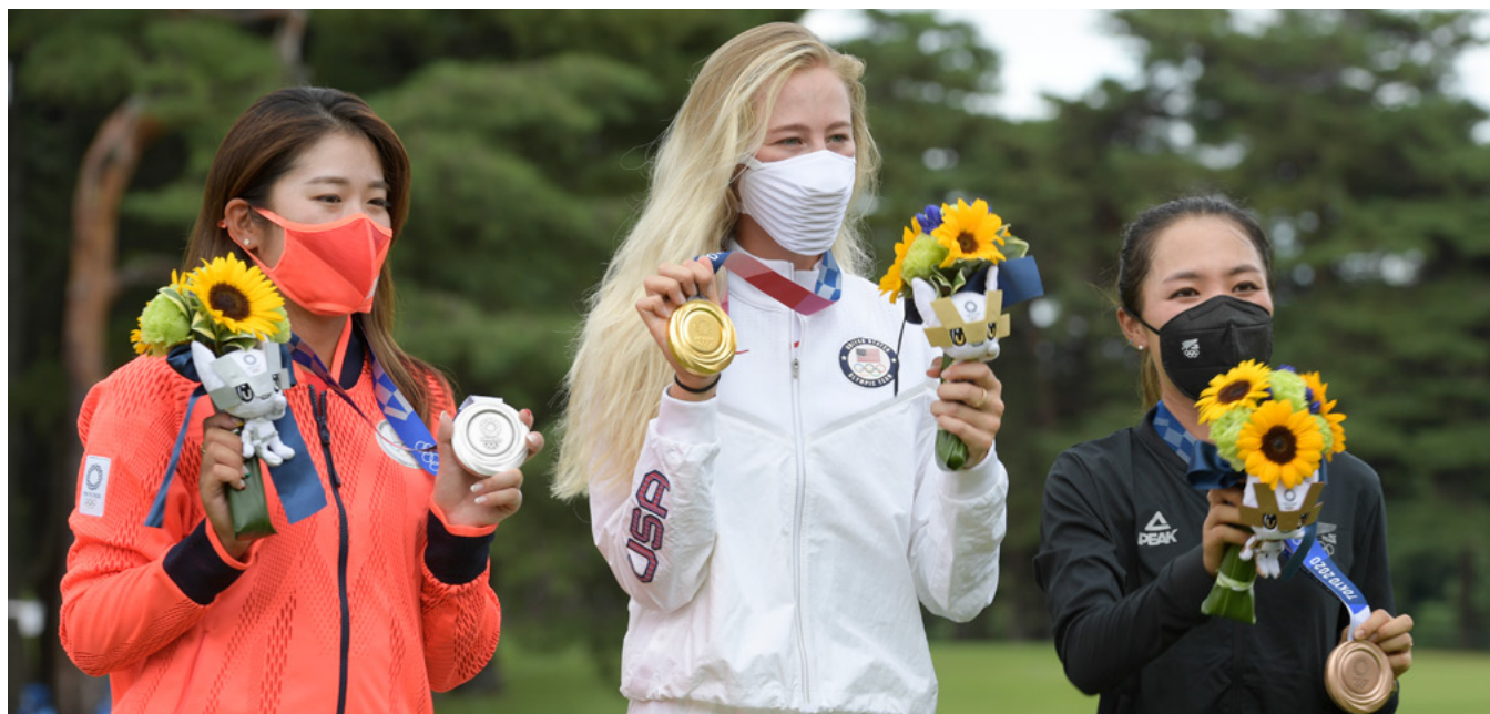
Mone Inami of Japan, Nelly Korda of USA and Lydia Ko of New Zealand, Tokyo 2020