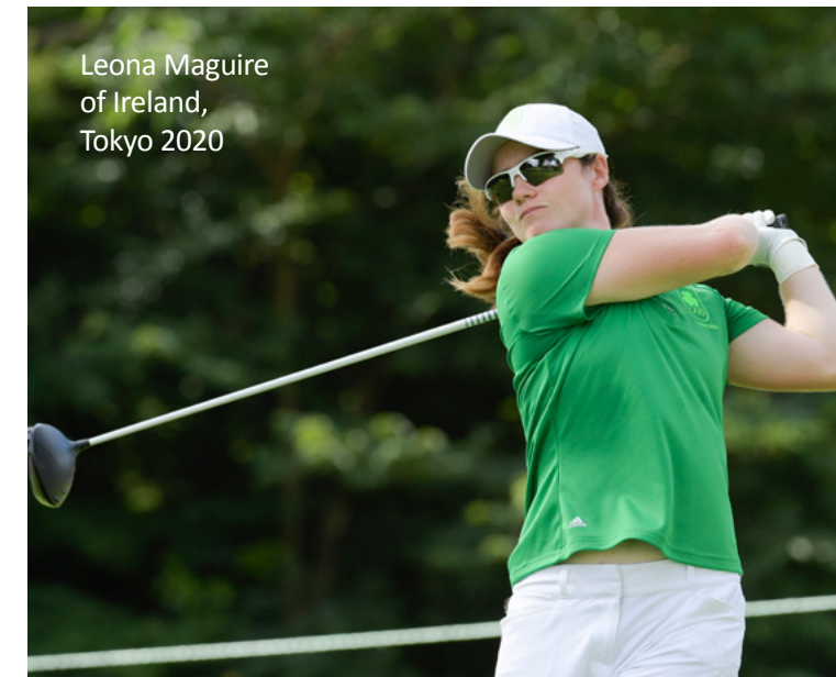
Leona Maguire of Ireland, Tokyo 2020

template in July 2022. The IGF continues to participate in UN-led webinars and workshops to share knowledge and expertise on climate and sustainability. The IGF maintains its relationships with sustainability experts to assist in the adjustment of its baseline carbon footprint and to track and reduce emissions. ►