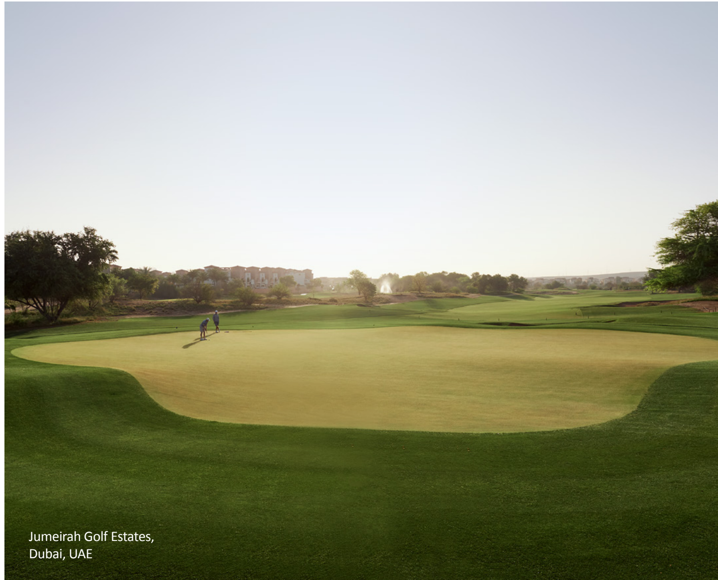
Jumeirah Golf Estates, Dubai, UAE

The event will be held at the prestigious Jumeirah Golf Estates in Dubai, United Arab Emirates. The 30th women's championship for the Espirito Santo Trophy and the 33rd men's championship for the Eisenhower Trophy will be held from 18-21 and 25-28 October, respectively. This marks the first time in Championship history that the event will be held in the Middle East. ►