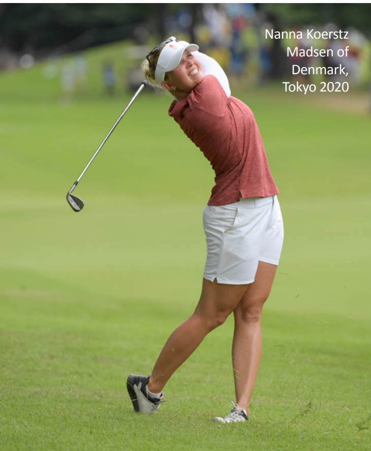
Nanna Koerstz Madsen of Denmark, Tokyo 2020

The IGF Athletes' Advisory Committee consists of representatives from each of the key professional golf tours, who have constant communication and contact with the athletes who are (or will be) eligible to qualify for the Olympic Games.