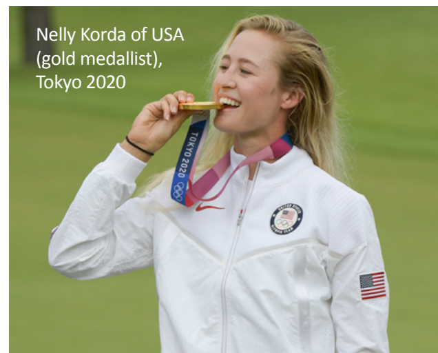
Nelly Korda of USA (gold medallist), Tokyo 2020

Korda then birdied the eighth, ninth and 10th to regain her advantage, while Ko made successive bogeys on 10 and 11 as Japan’s Mone Inami started a thrilling late charge for the podium. The host nation favourite made five birdies between the 12th and 17th holes to earn a share of the lead, eventually ►