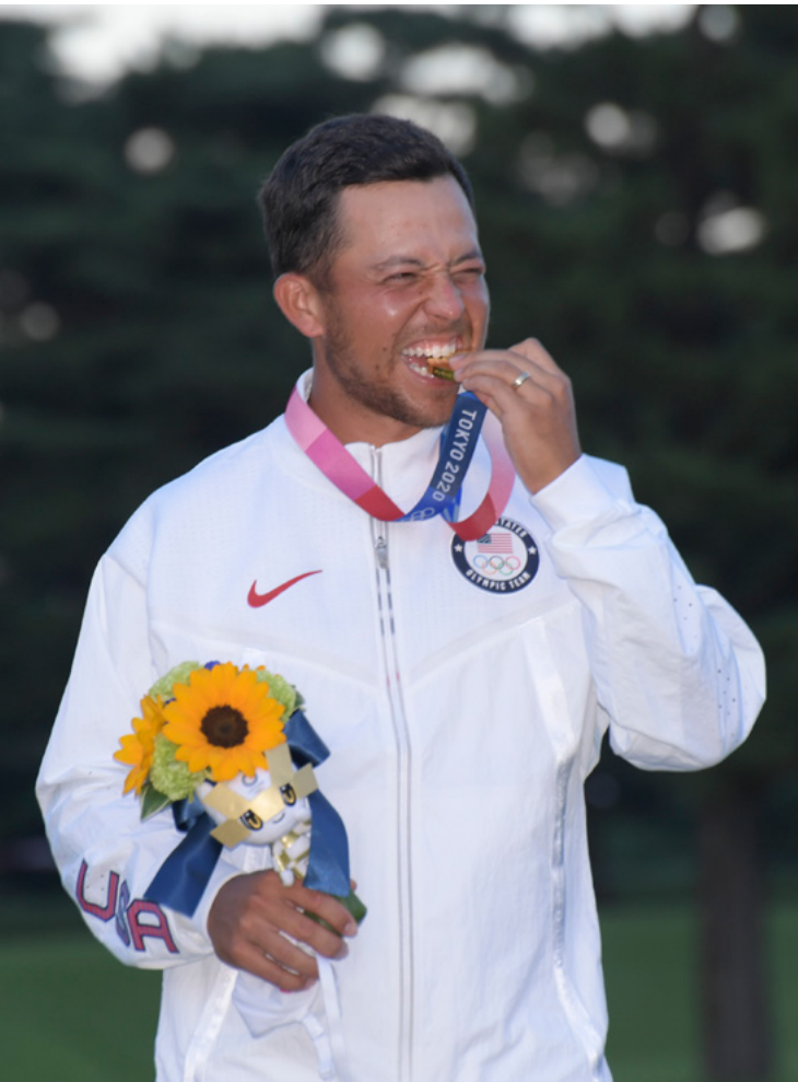
Xander Schauffele of USA (gold medallist), Tokyo 2020