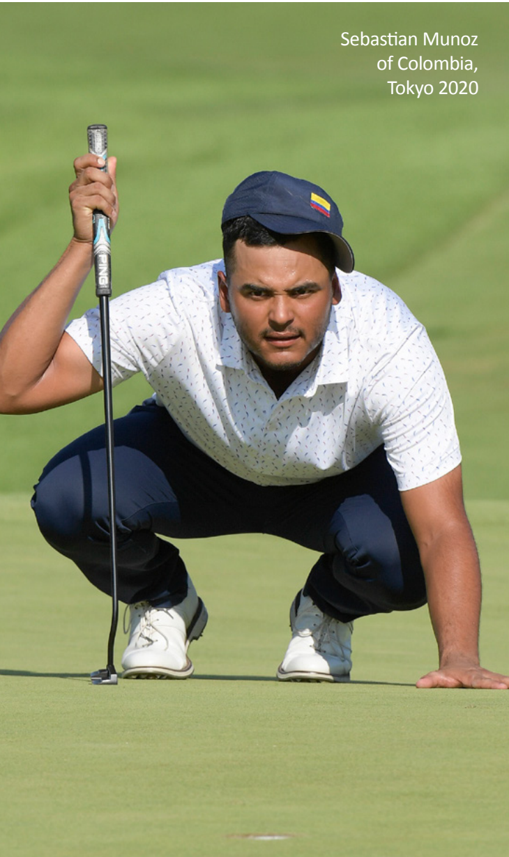
Sebastian Munoz of Colombia, Tokyo 2020