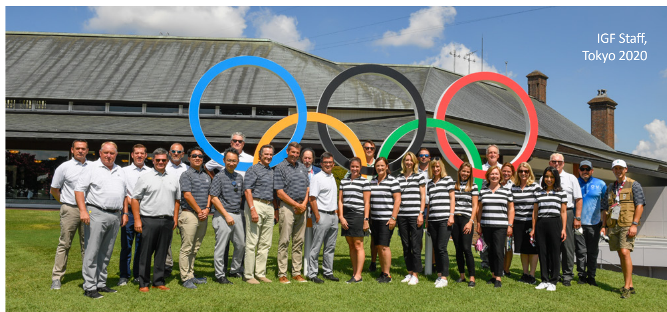
IGF Staff, Tokyo 2020

It is my pleasure to present the Executive Director's Report on the activities of the IGF Administration since the Biennial Meeting held on 19 October 2020 to the IGF's membership.