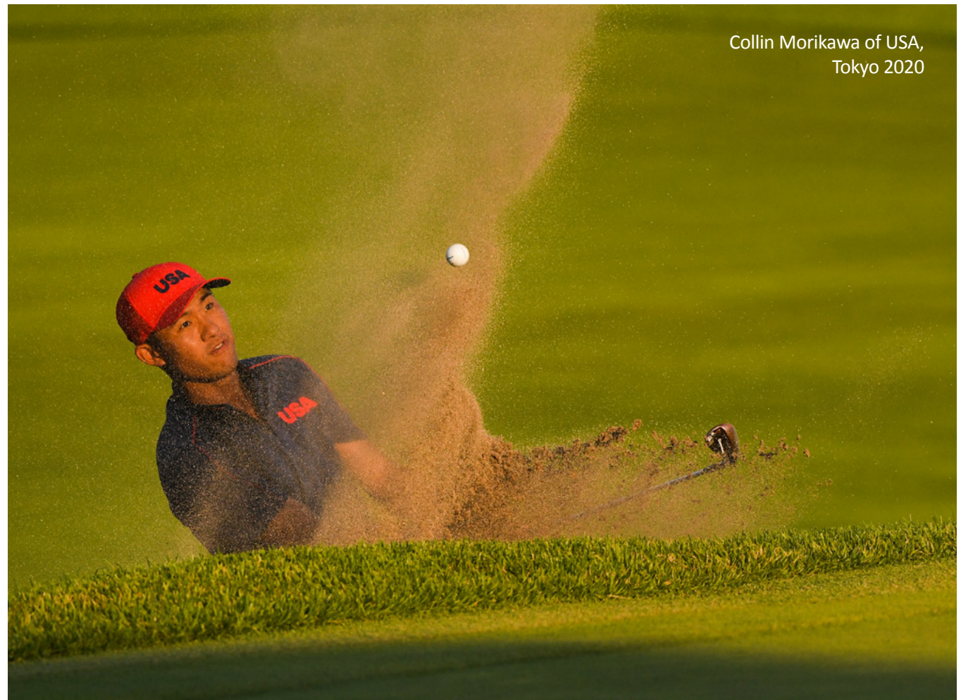
Collin Morikawa of USA, Tokyo 2020

The IF Forum, organised annually by Sport Accord and GAISF, was held virtually on 5 November 2021, with more than 400 attendees. At the forum, the Executive Director was asked to deliver a case study on golf's participation in the Olympic Games Tokyo 2020. The study outlined the inherent and COVID-19-specific challenges the IGF faced and the strategies and solutions implemented to overcome these and ensure successful delivery of the golf competitions. ●