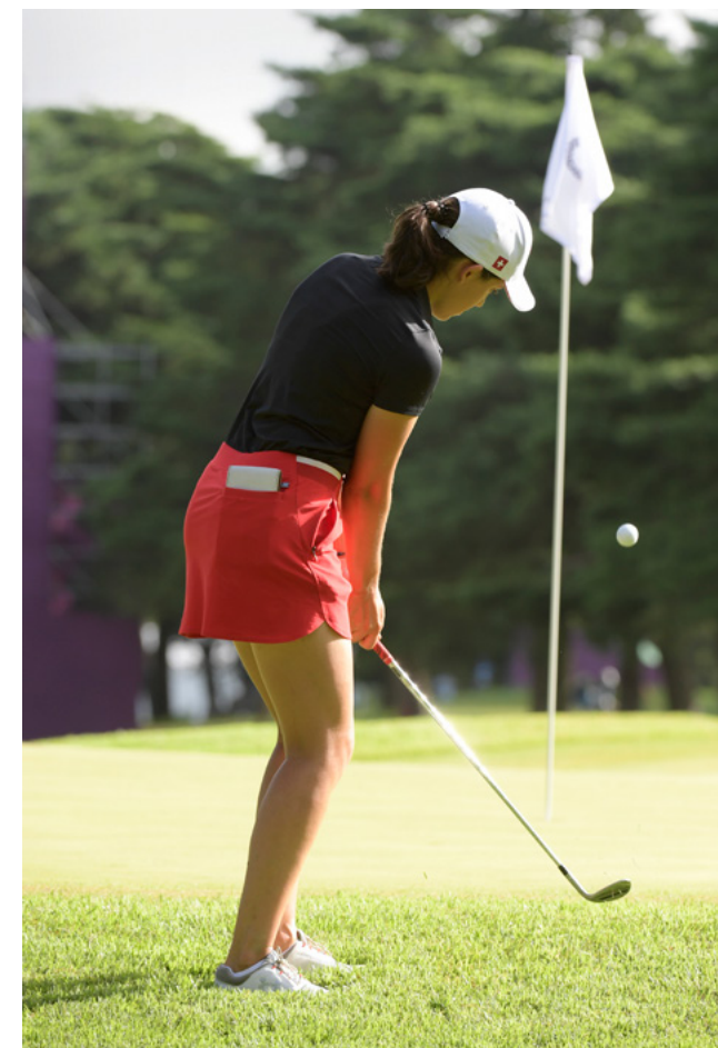
Albane Valenzuela of Switzerland, Tokyo 2020

The only negative felt across all stakeholder groups was the impact COVID-19 had on the overall atmosphere of the Games and the fact the athletes and teams could not fully appreciate the Olympic experience. Nevertheless, 80 per cent of the athletes agreed/strongly agreed that being selected by their countries for the Olympic Games ►