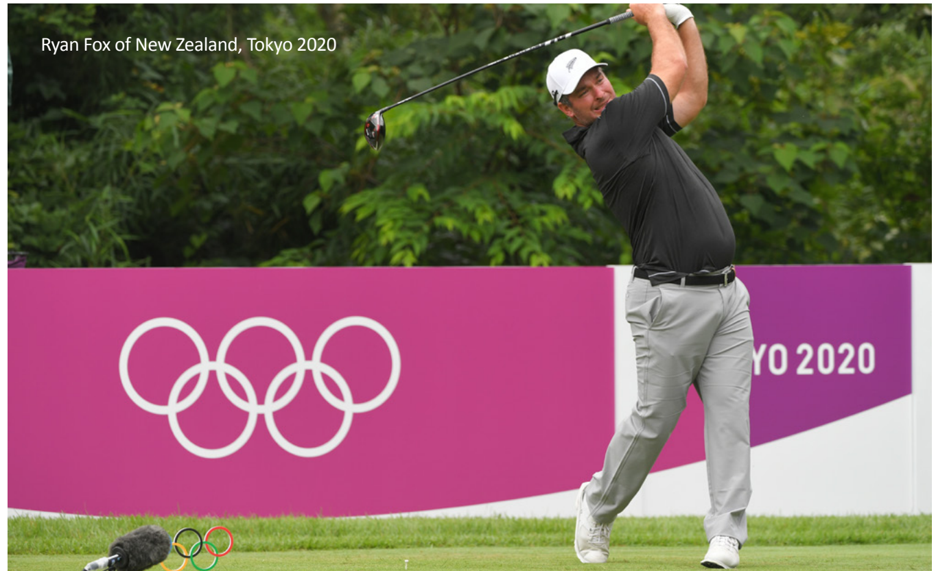
Ryan Fox of New Zealand, Tokyo 2020

As a result of the pandemic, the Competitions Committee was asked to significantly reduce the number of International Technical Officials to ensure compliance with the International Olympic Committee, the Japanese Government and Tokyo 2020's mandate to reduce the