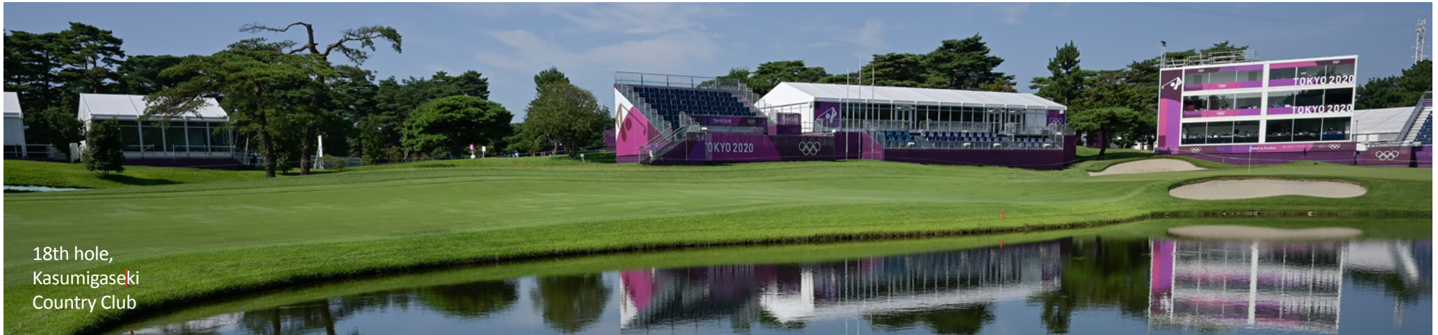
18th hole, Kasumigaseki Country Club

For the Olympic Games Paris 2024, scholarships have currently been awarded to the following seven athletes and their NOCs: