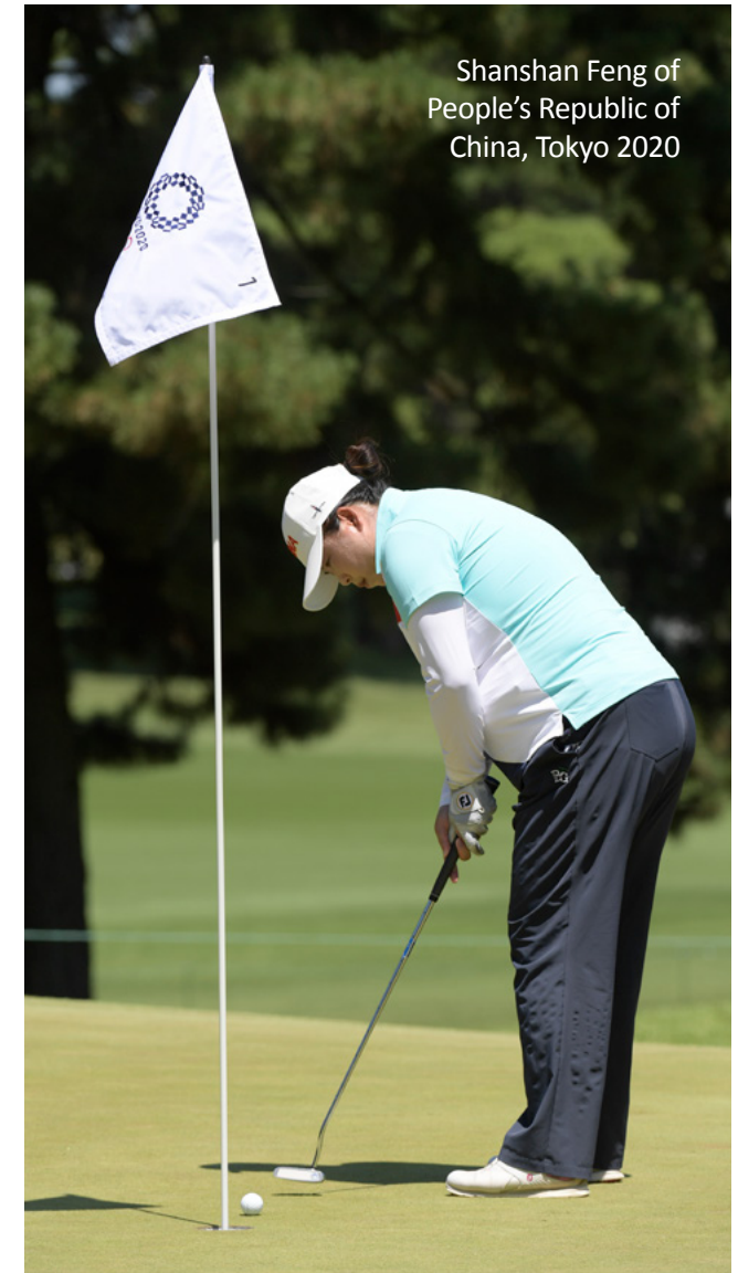
Shanshan Feng of People's Republic of China, Tokyo 2020