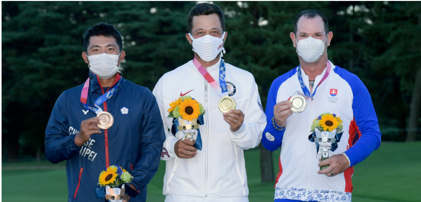
CT Pan of Chinese Taipei, Xander Schauffele of USA and Rory Sabbatini of Slovakia, Tokyo 2020

Paris 2024 was a goal for them, which further confirmed that participating in the Olympic golf competition had become a high priority for athletes.