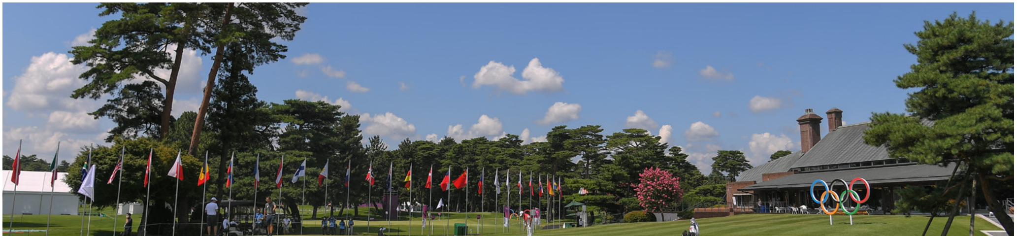
Kasumigaseki Country Club