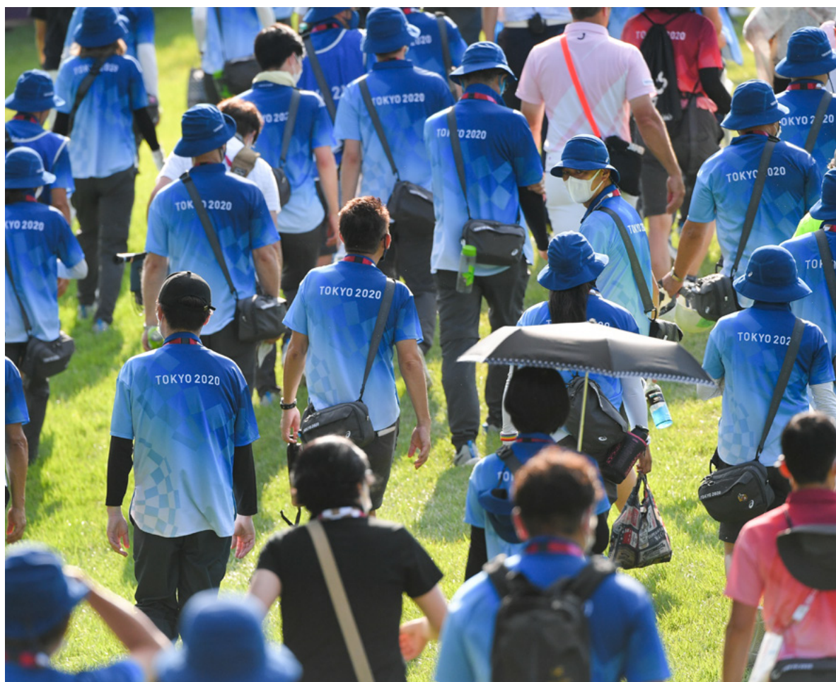
Volunteers, Tokyo 2020