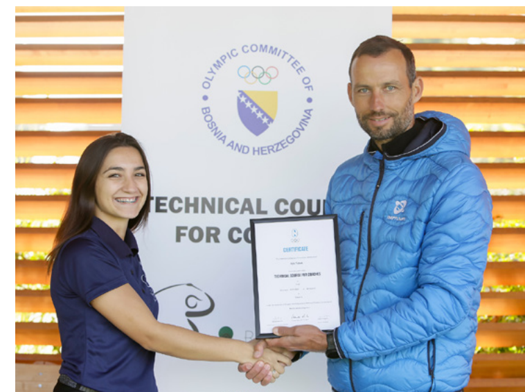
Technical Course for Coaches, Bosnia and Herzegovina

in the Olympic golf competition. Leona Maguire (Ireland) and Maha Haddioui (Morocco) finished T23 and T43 respectively in the women's competition, while Joaquin Niemann (Chile) ranked T10 and Fabrizio Zanotti (Paraguay) finished T35 in the men's event. These scholarships undoubtedly had a positive impact on the athletes' overall training and preparation. ●