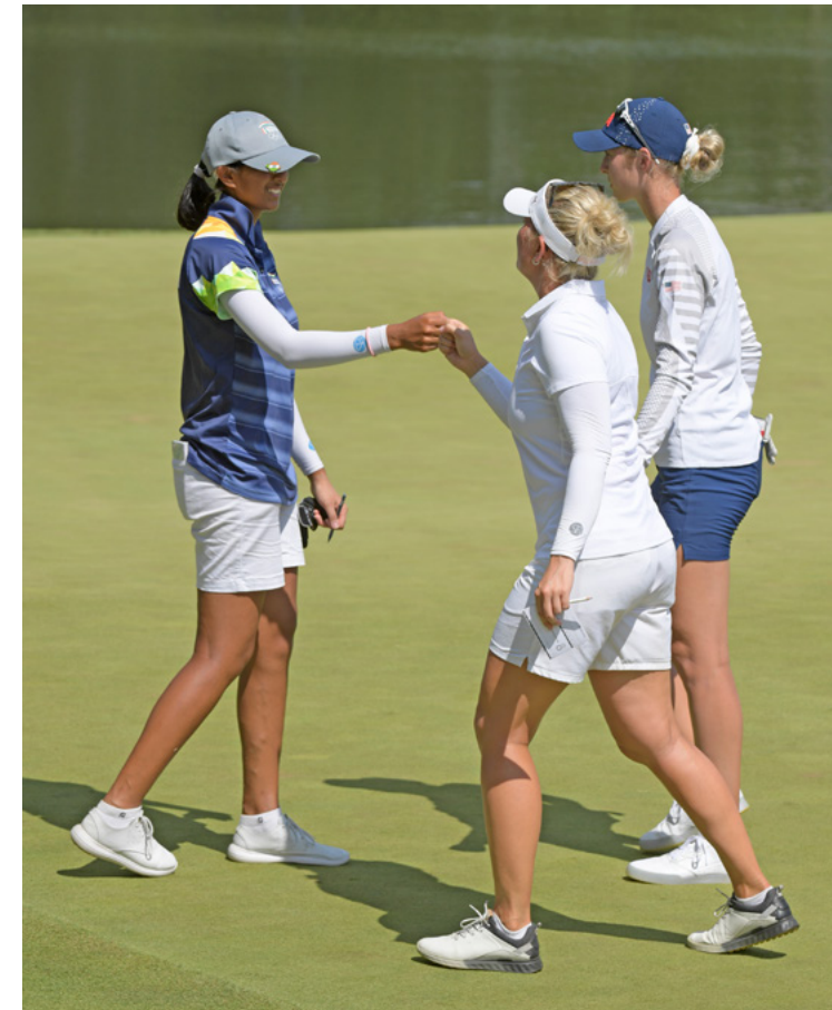
Aditi Ashok of India, Nanna Koerstz Madsen of Denmark and Nelly Korda of USA, Tokyo 2020

Despite the setback, Schauffele kept his cool and managed to regain the lead with a birdie on the short par-4 17th, but another wayward drive into the right rough on the 18th set up a tense finish. Blocked by trees, the American was forced to lay up short of the water, knowing that an up-and-down from ►