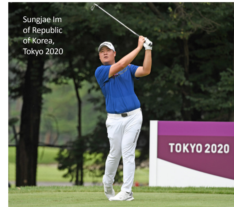
Sungjae Im of Republic of Korea, Tokyo 2020

Planning for the inaugural 2023 Golf for the Disabled World Team Championship is being developed and is a major component of the IGF's bid for inclusion in the 2028 Paralympic Games. The Championship will be a biennial event. It is hoped that the announcement of a 2023 Golf for Disabled World Team Championship will be the impetus for National Federation members to ►