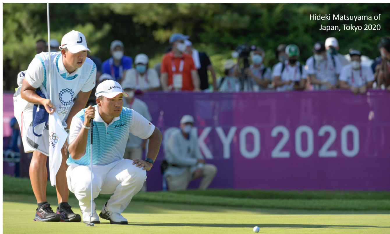
Hideki Matsuyama of Japan, Tokyo 2020

We draw your attention to the fact that the financial statements of International Golf Federation disclose an excess of liabilities over assets. ●