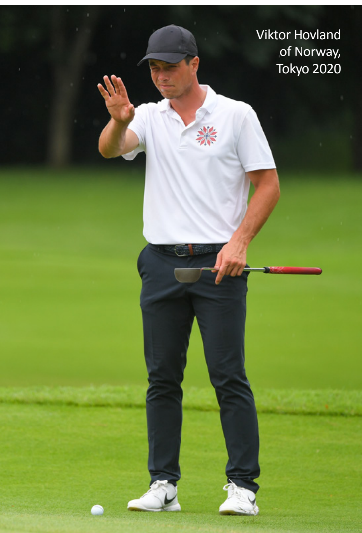
Viktor Hovland of Norway, Tokyo 2020

Following the four-year postponement of the Youth Olympic Games (YOG) in Dakar, the Dakar 2026 Organising Committee and the International Olympic Committee (IOC) have been working closely to make the most of this additional time by putting together a unique programme of activities to mobilise young people in Senegal and Africa and transform the Senegalese sports sector in the long term.